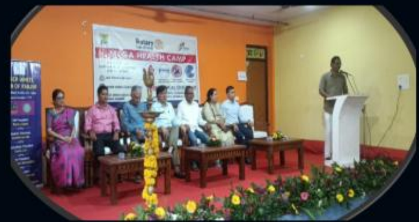
MEDICAL CAMP 25/08/2024