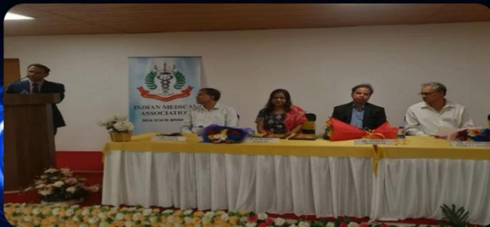
STATE LEVEL CME To Commemorate World Kidney day 10/03/2024