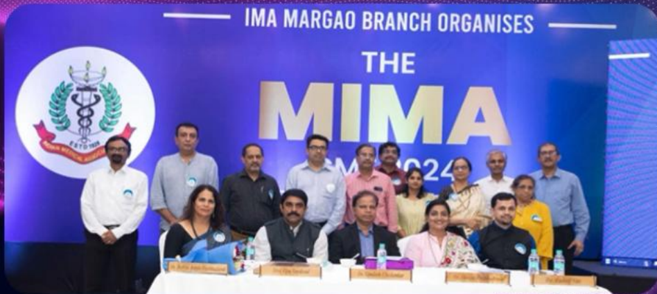
Annual MIMA CME 29/06/2024