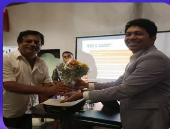
CME ON DIAGNOSIS AND MANAGEMENT OF ALLERGIES