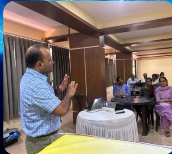
C.M.E. on Demystifying Glaucoma