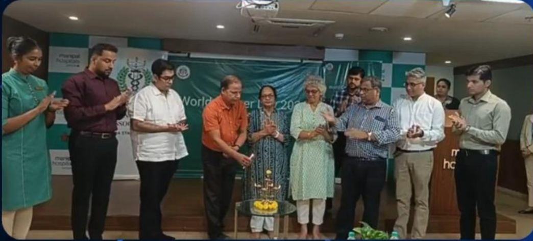
IMA Goa State in association with Manipal Hospital (MH), Goa, organized an event to commemorate World Cancer Day on 3/2/2024.