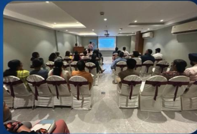
CME Community Acquired Pneumonia: Practical Consideration For Effective Management" 23/03/2024