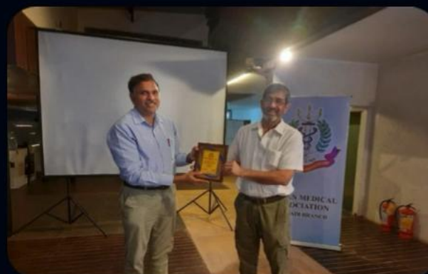
Endometriosis Awareness Month CME 22/03/2024