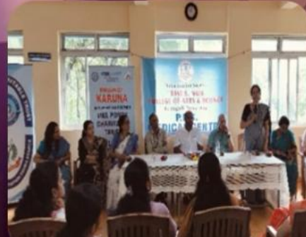
Health camp 28/09/24