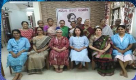
Blood sugar camp 15/03/2024