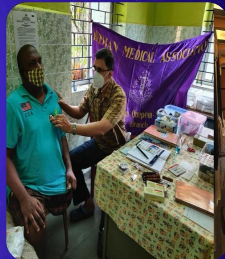
Monthly Free Checkup at Missionary of Charity, Quepem