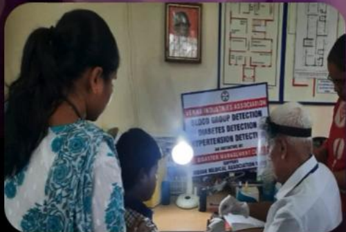
Blood group camp 31/07/24