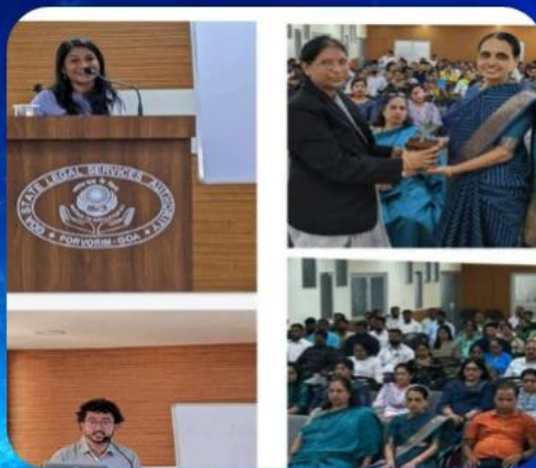
STATE LEVEL PROGRAM PALAK MITRA 09/03/2024