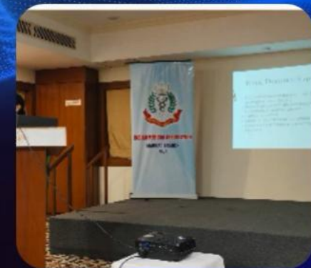
CME GERD 16/08/2024