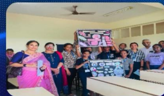
Health talk on Menstrual hygiene