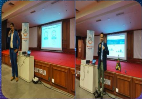
CME 24 /05/2024