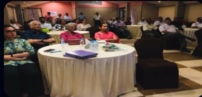
28/06/2024 CME Liver Diseases