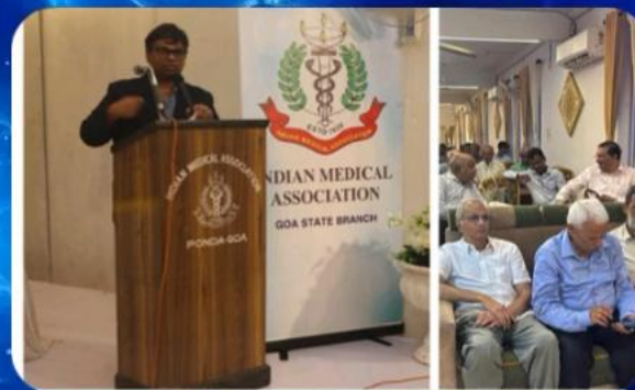
State Level Program "Demystifying Living Will and End of Life care in Goa" On 22/06/2024