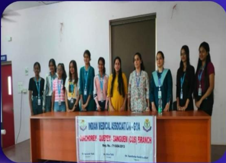
Talk on Womens health and hygiene