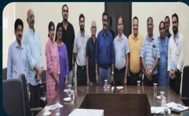
IMA Goa meeting with the Chairman, Goa State Pollution Control Board (GSPCB) on 03/05/2024