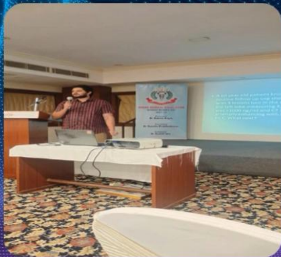
CME ON ADVANCES IN PROCTOLOGY