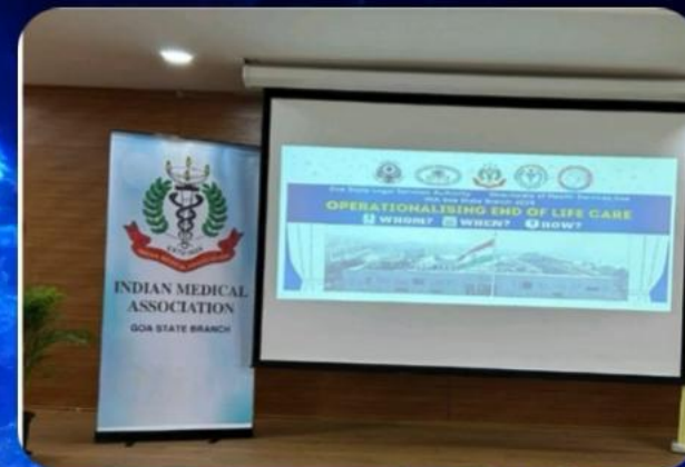
Seminar on End of life Care: Whom, When and How? 21/03/2024