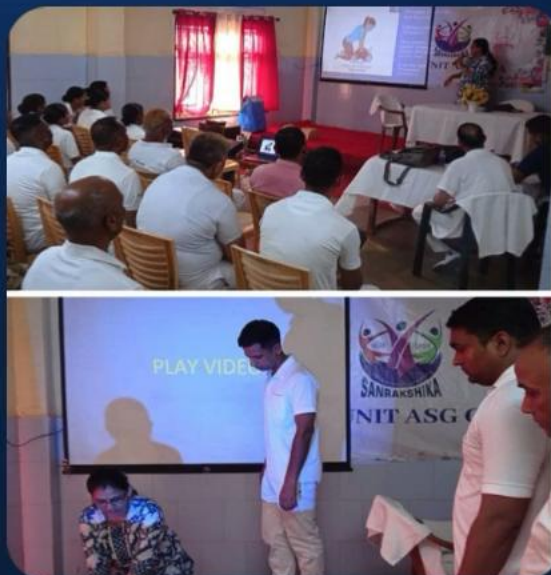
COLS workshop 15/04/2024