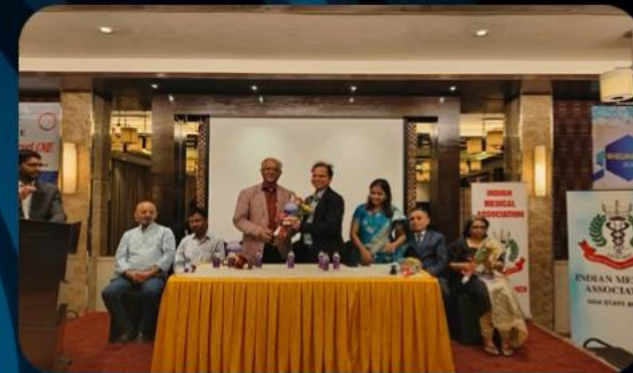
State level CME Rheumacon 14/04/2024