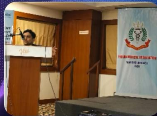
CME nephology 30/08/2024