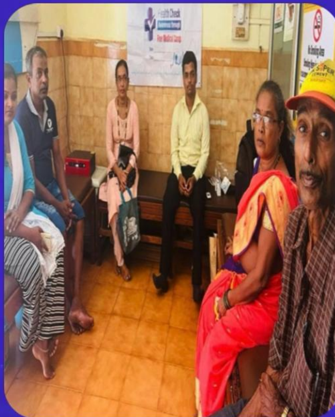
Diabetes detection camp Aon Gaon Chalen