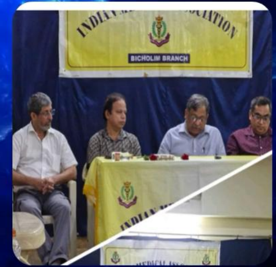
C.M.E. on Anemia In Pregnancy & Male Infertility