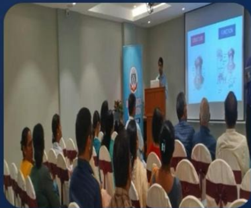
CME ON THYROID DISORDERS