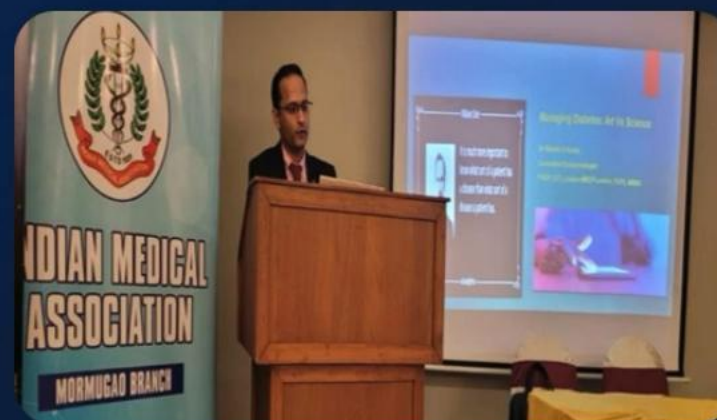
CME ON DIABETES