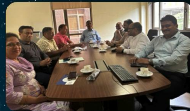
IMA Goa with Directorate of Education on 21/05/2024 to finalize the protocols of "Training of Trainers (ToT)- Stress Management & Parenting Skills,