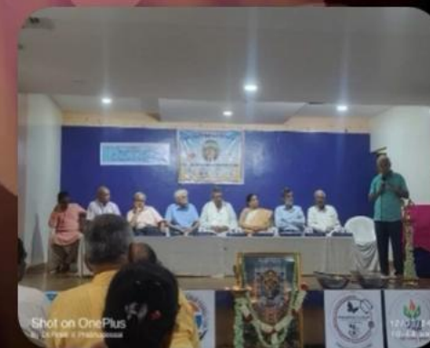
Medical camp 12/05/2024