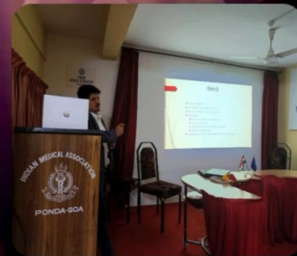
Red flag in vertigo CME 24/05/24