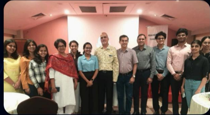
Approach to Neurosurgical Emergencies CME 26/04/2024