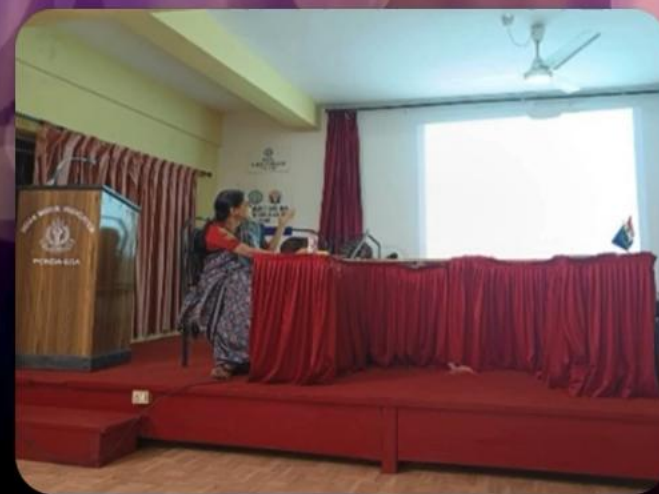
CME 09.03.24 Glaucoma- the silent cause of blindness