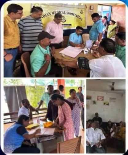
Multi-speciality Medical Camp 18/04/2024