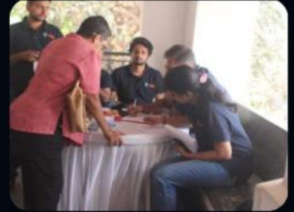
MEDICAL CAMP 10/03/2024