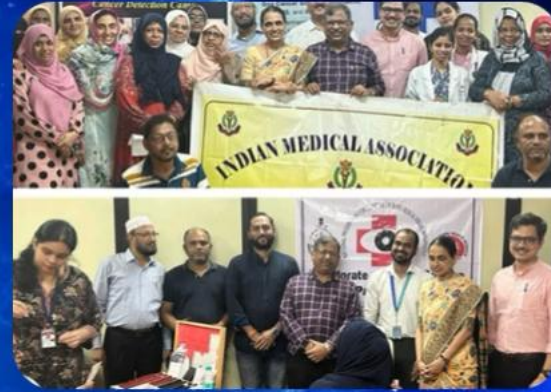
Medical camp on 7 July'24