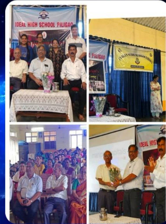
Awareness Talk on Cancer 22/08/2024