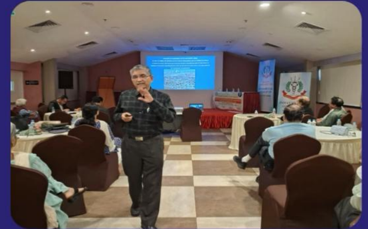
IMA GOA STATE along with Manipal hospital Celebrated Yoga day on 21/06/2024