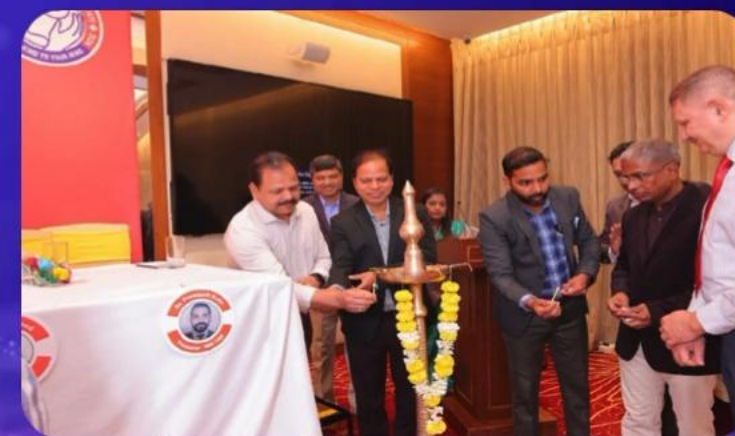
State level CME in association with IMA Goa State