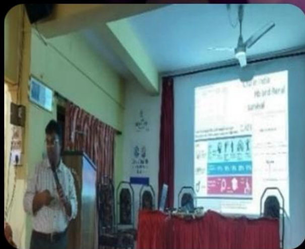
CME ON CKD