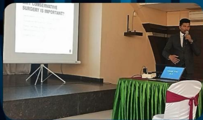
Installation ceremony of the executive committee and CME on "organ preservation, conservation surgeries and reconstruction in cancer,,