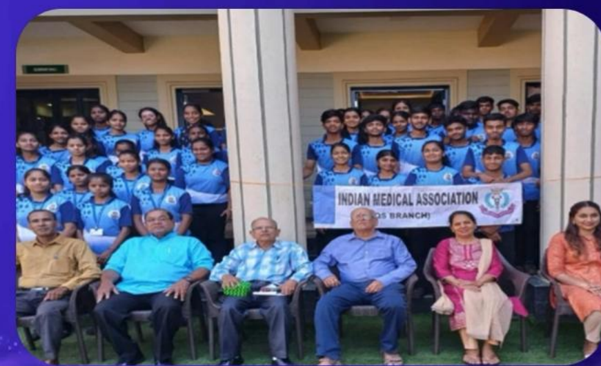
Career Guidance Program 17/02/2024