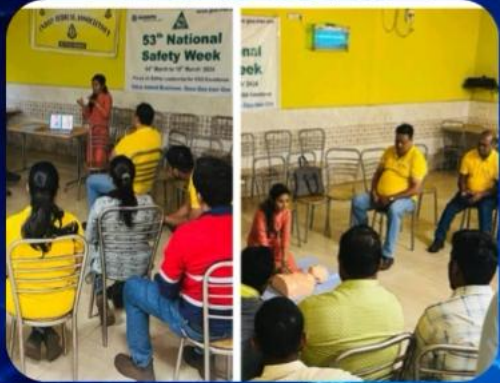
COLS PROGRAM 09/03/2024