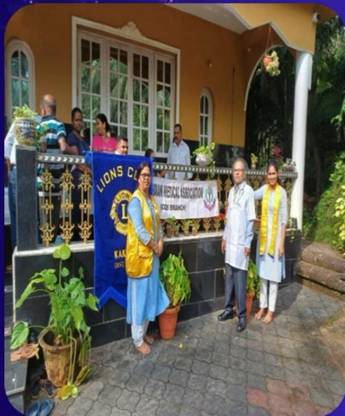
Diabetes and hypertension detection camp