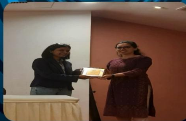
Women's day CME 09/03/2024