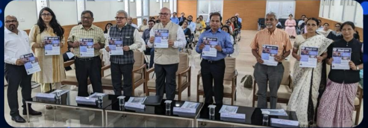
IMA Goa State branch with Goa State Legal Service Authority and Sangat Goa, organized a program on sensitization of judicial officers on stress management at the workplace on 10/02/2024.