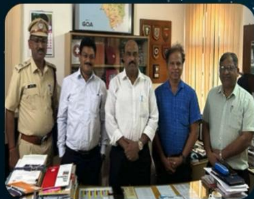
IMA Goa meeting with director of Fire dept