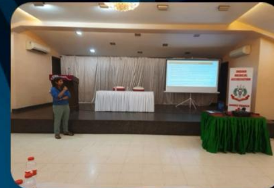
CME Uncontrolled DM & CKD 20/07/2024