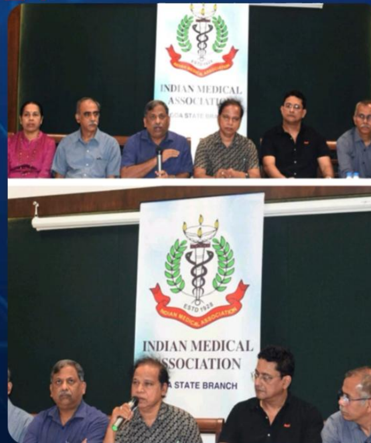
Press Conference to brief Media about on the eve of Protest March of 17/08/2024