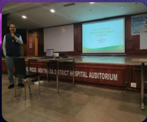
CME on EPILEPSY