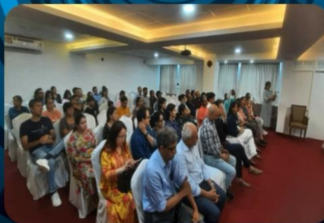
Doctors day Healthy Diet and lifestyle on 07/07/2024