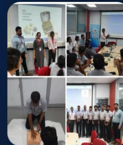
COLS workshop 30/04/2024