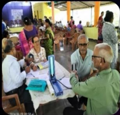
Medical camp 9/6/24