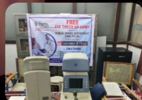
Eye Check up 27/09/24