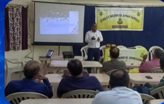
CME on 30/03/2024