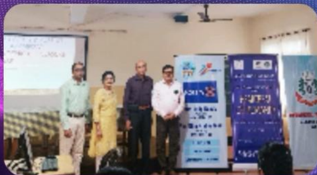
Health Talk 03/08/2024