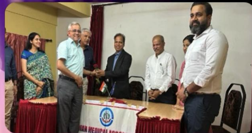
INSTALLATION OF NEW COMMITTEE 2024 19/01/24