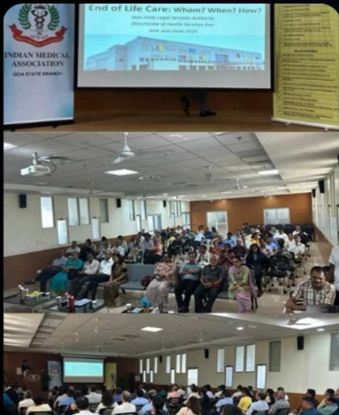
IMA Goa State ,Goa State Legal Services Authority and Directorate of Health Services, Goa conducted a Seminar on End of life Care: Whom, When and How? 21/03/2024