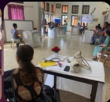
Health camp 23/6/24