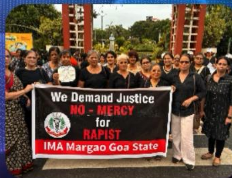
Protest Rally 22/08/2024