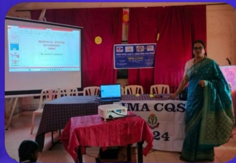
Talk on Menstrual Hygiene 28.02.24