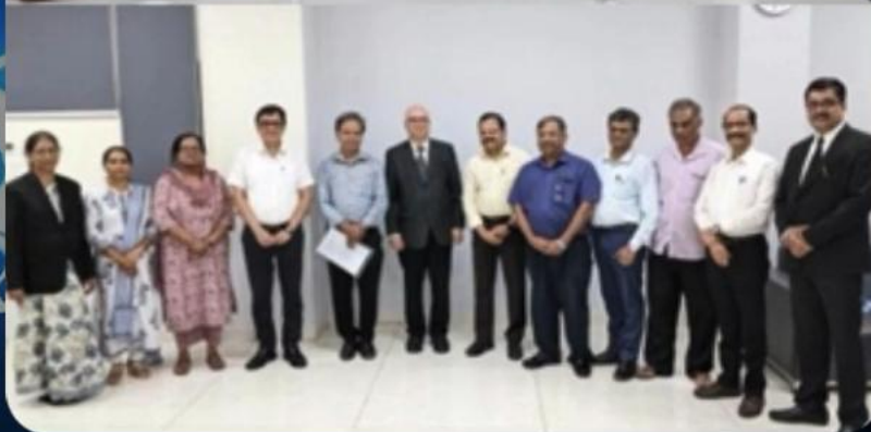
Final and concluding meeting on operationalizing END OF LIFE CARE AND Medical facility 28/03/2024