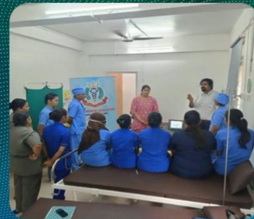
COLS workshop 28/06/2024