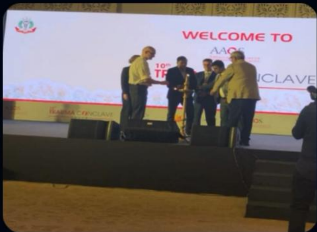
National level Trauma Conclave in Orthopedic injuries 2-4 MARCH'24