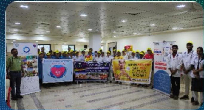
World heart day celebration 26/09/2024