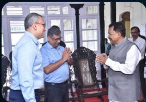
IMA Goa State thanked Hon Governor of Goa Mr Pillai for support in passing CEA ordinance