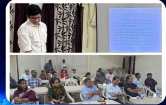
Monthly cme 28/07/2024