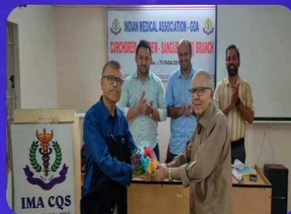
CME Challenges faced In OBG Practice on 16/02/2024