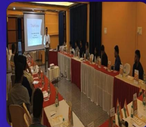
Post SURGICAL REHABILITATION CME ON 15/10/2023