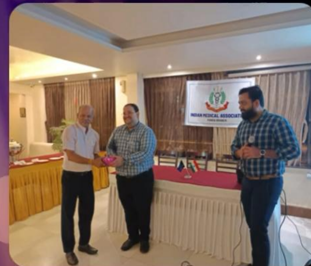
CME 17/04/24 BREAST CANCER AND RECENT UPDATES