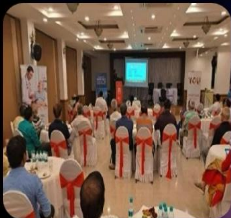
CME ON GYNEC CANCERS