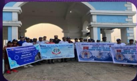
Walkthon and Diabetes detection camp