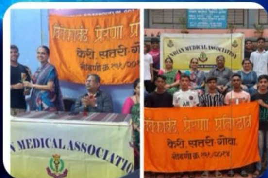
LECTURE ON "YOUTH & ADDICTION " 25/05/2024