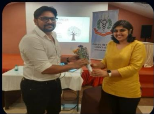
Women's Day CME 09/03/2024