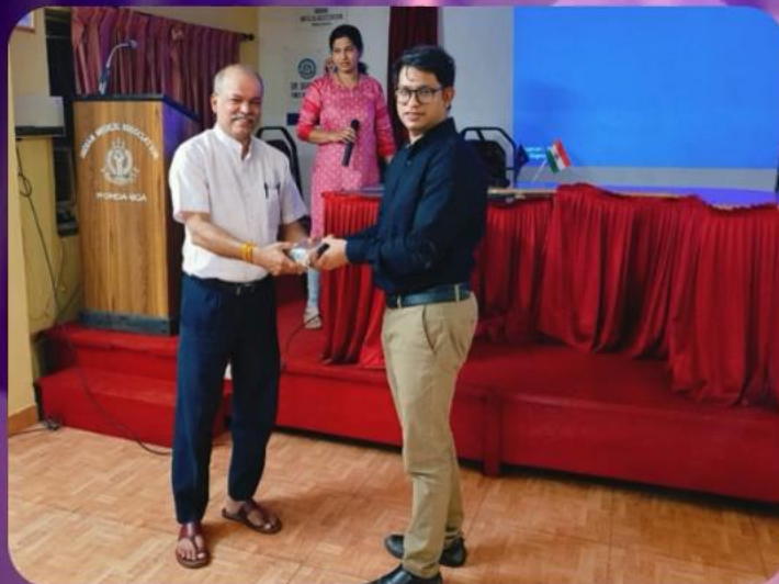
CME 24.02.2024 Hypothyroidism- Diagnosis and Treatment