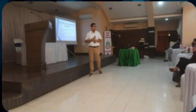
CEA CME 15/03/2024