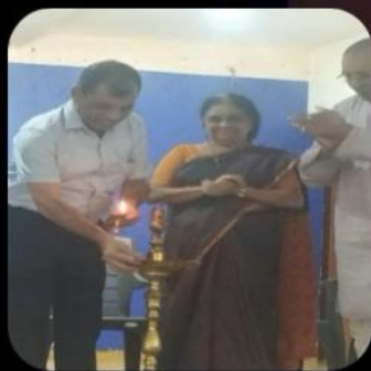
Health camp 28/07/24