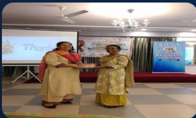
CME ON HIV