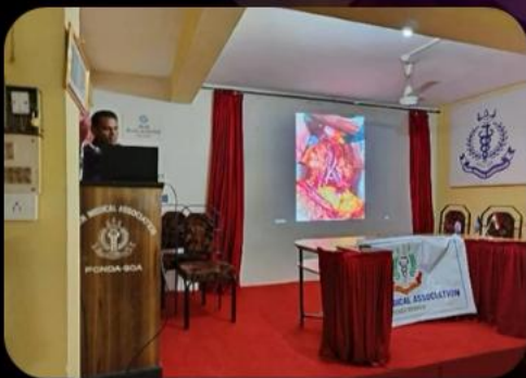
CME 20/04/24 Advances in the Treatment of DVT and Pulmonary Embolism