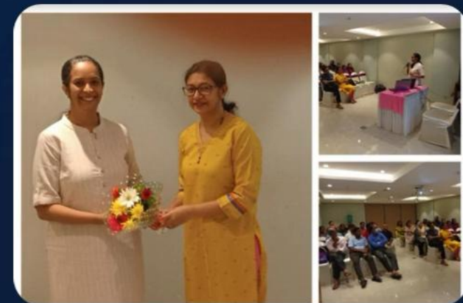
Mental health :Diagnostic Challenges 30/08/2024