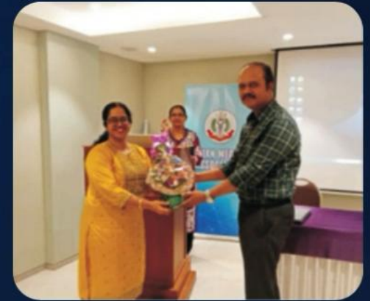
CME on 17th May 2024