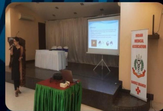
Glaucoma week CME 15/03/2024