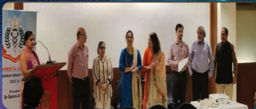
Installation ceremony 17/01/2024