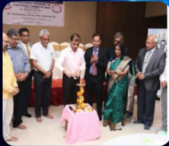
Installation of Goa State IMA Executive organized by IMA Bicholim 07/01/2024