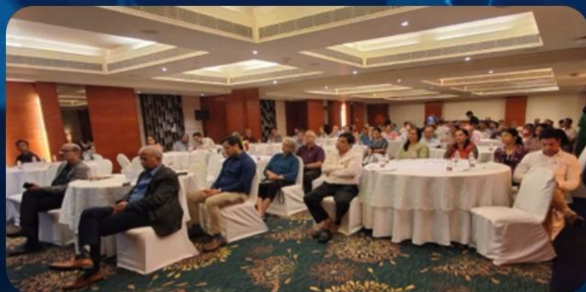
STATE LEVEL CME Organized By IMA Goa State in Association with ARIHANT HOSPITAL ON 03/08/2024