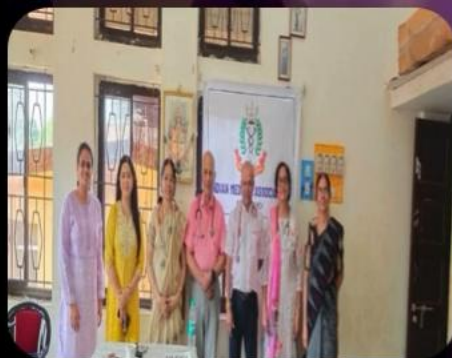
Health camp 15/02/2024