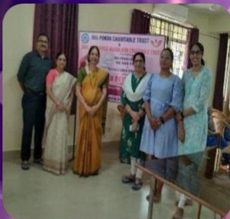
BREAST AND CERVICAL CANCER AWARENESS CAMP