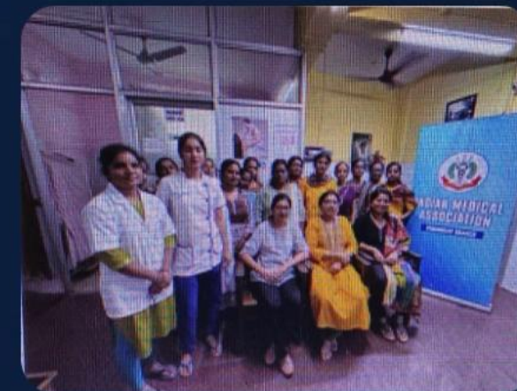
Cervical cancer detection camp