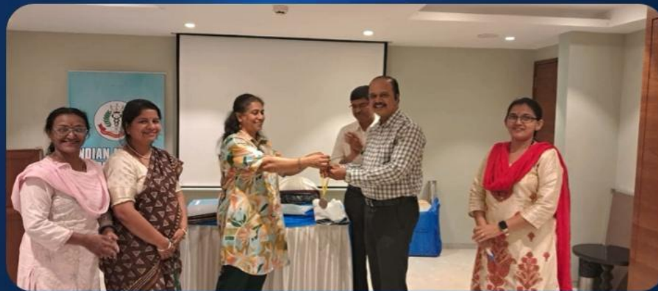
AGM AND INSTALLATION PROGRAM 11/01/2024