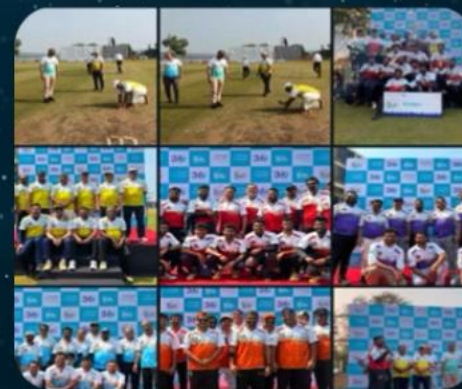
Inter Branch IMA Cricket Tournament