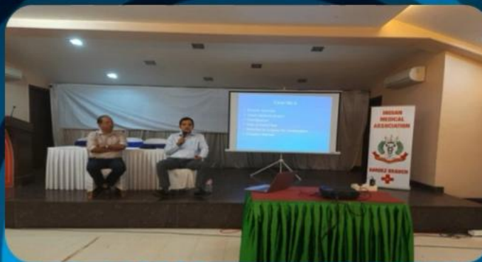
CME 15/06/2024 on Practical approach to abdominal pain