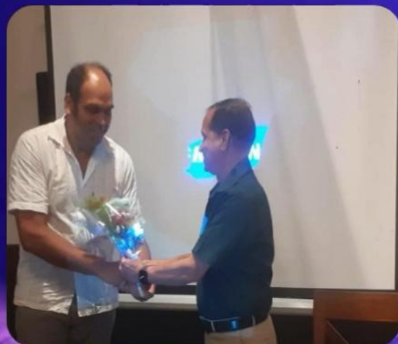
CME ON RECENT ADVANCES IN CANCER