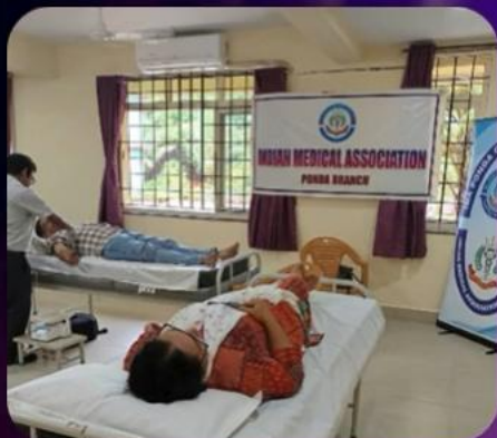
BLOOD DONATION CAMP 14/06/2024