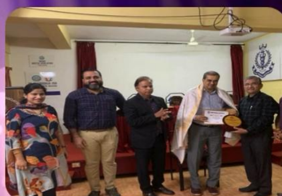
Doctors day celebration 30/6/24