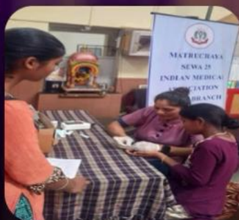
Hb camp 06/04/2024