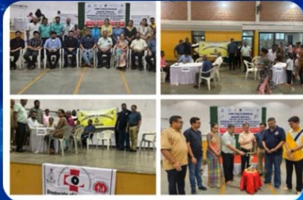
Multi speciality Medical cam 21/07/2024