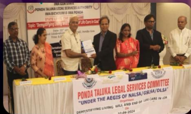
STATE LEVEL PROGRAM