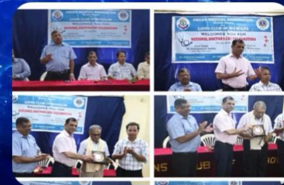
Doctors Day celebrated on 01/07/2024