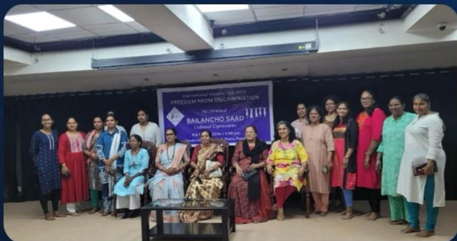
Talk on International Women's Day