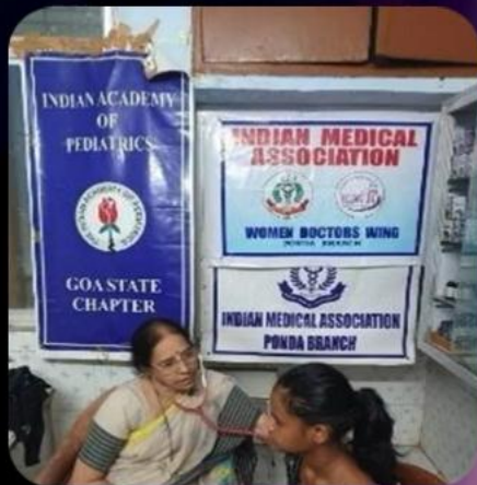
CANCER DETECTION CAMP