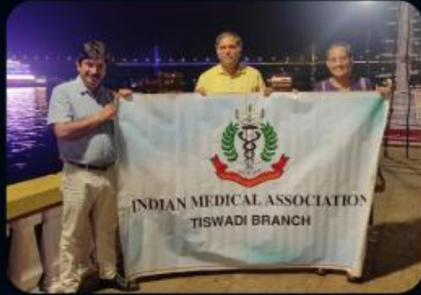
WORLD DOWNS DAY 21/03/2024