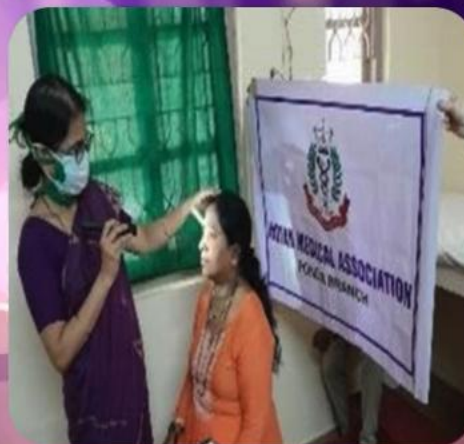
EYE CHECKUP CAMP