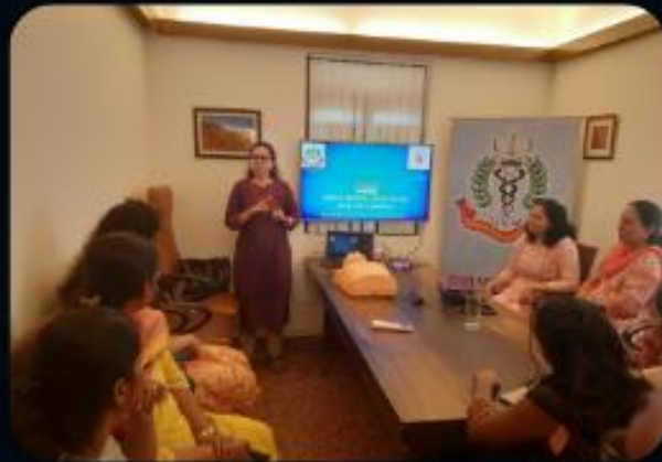
COLS workshop on Women's days 08/03/2024