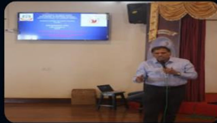
COLS WORKSHOP 10/03/2024