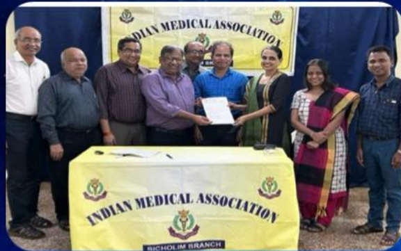
IMA BICHOLIM NEW EXECUTIVE COMMITTEE INSTALLATION 03/01/2024