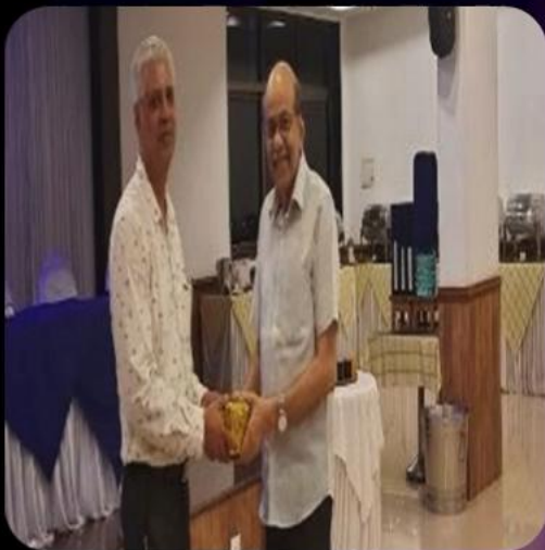
CME ON ENDOVENOUS LASER TREATMENT