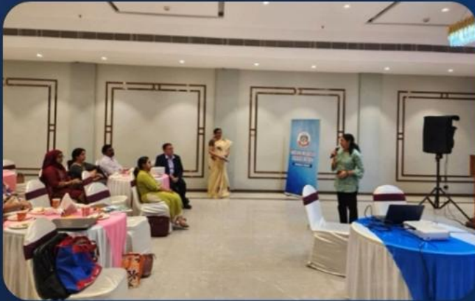
CME on "Laboratory Diagnosis Of PUO/Infections., 23/03/2023