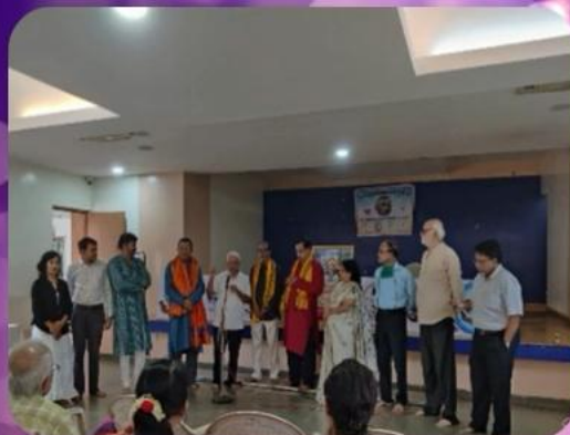
Health camp 23/6/24