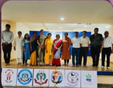
Health camp 25/08/24