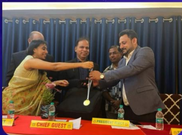
The Installation Ceremony cum CME of IMA CQS 12/01/2024