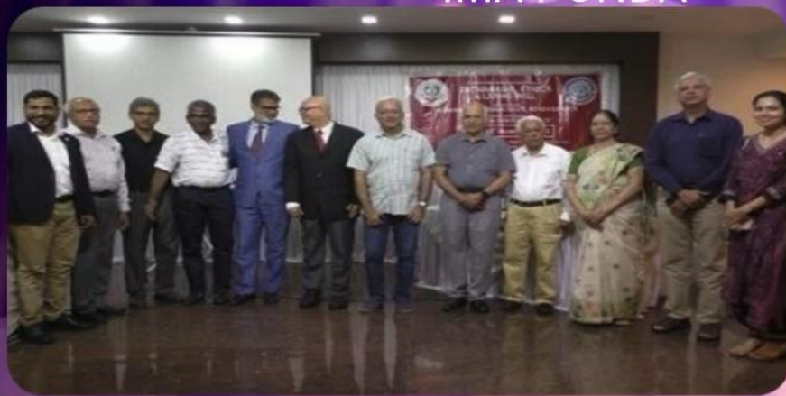
CME ON LIVING WILL AND EUTHANASIA 10/11/ 2023