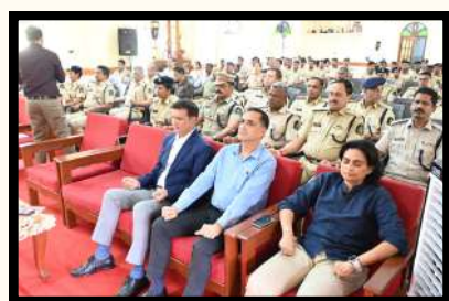
Top Police officials engaged in a stress combating activity.