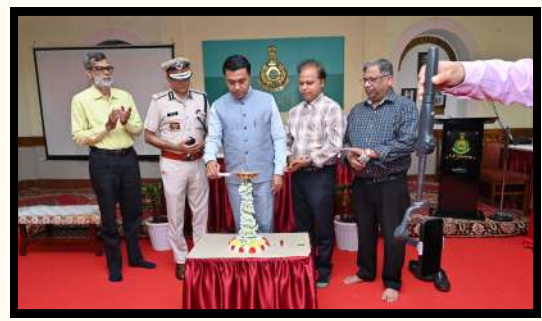
Lunch of Manas Mentors and Swasth Police Sashakth Police Campaign

"Swasth Police Sashakth Police" campaign was also launched on the occasion, the one year project will involve monthly screening of 1500 police personnel in North Goa, health parameters like Blood Pressure, Random Blood Glucose, and Body Mind Index (BMI) will be documented along with medical support from Telemedicine society of India (Goa) and IMA Bicholim.