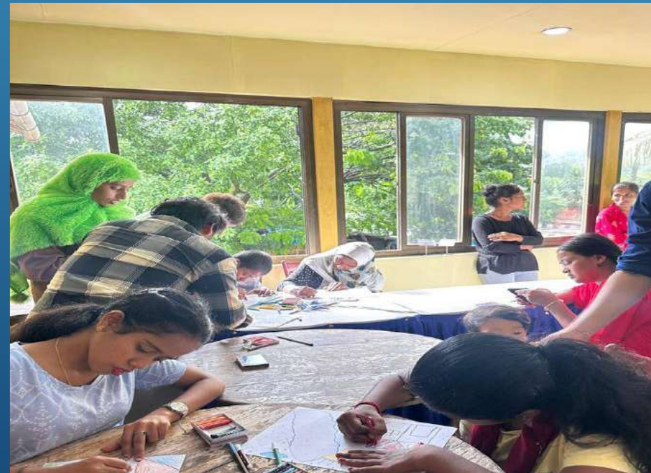
PLAYFUL INTERACTION WITH CHILDREN