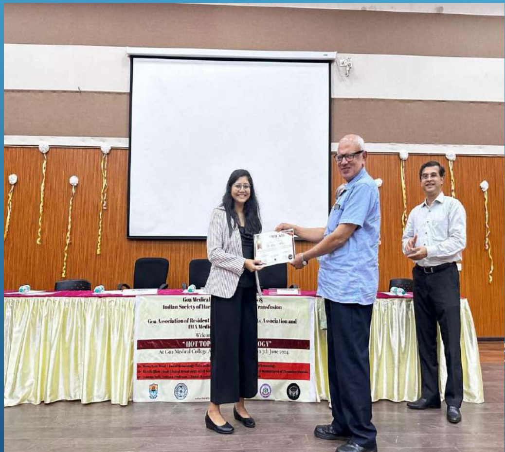
Winners of the National Level Quiz