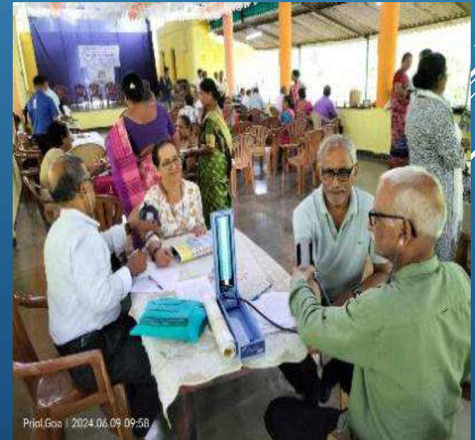
Priol,Goa | 2024.06.09 09:58