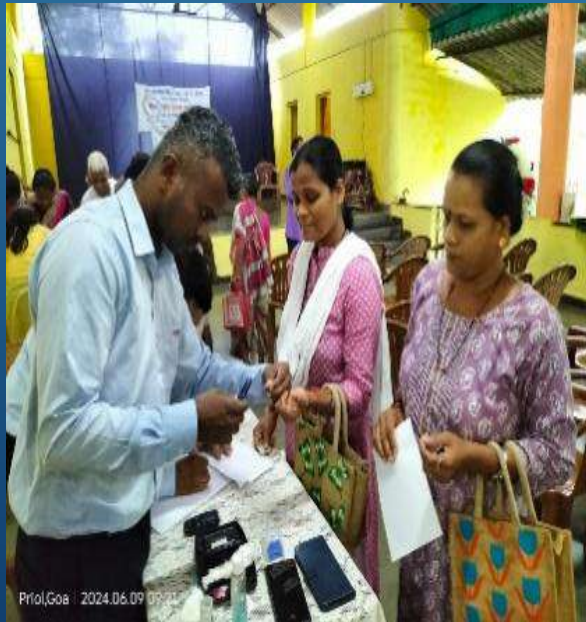
Priol,Goa | 2024.06.09 09:21