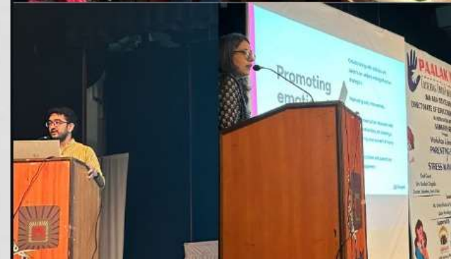
IMA Goa state program PALAK MITRA