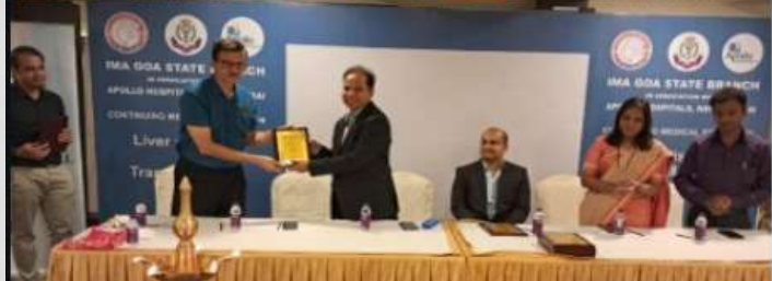
IMA GOA STATE CME